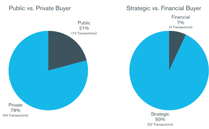
Exhibit 2: Staffing Industry Transaction Activity - YTD June 30, 2014